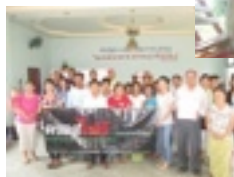
Crossfire Burma Pastors and Leaders

One of the devil's greatest weapons against us is fear. He will use fear to try to keep us from going to new levels and