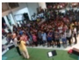
Salvation alter call night 2 Crossfire Lahu Thailand camp 2013

We then returned to Thailand and traveled to Chang Rai, to lead the