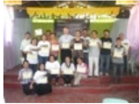
New Crossfire Philippines local church/pastors implementation

We began our time in Mindanao with Crossfire presentations to local