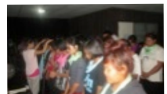
Crossfire Thailand Rayong camp salvation alter call night 1

The first Crossfire Thailand camp this year was at a Thai national park where there were waterfalls, wild elephants and 108 degree weather each day. The majority of the youth this year who