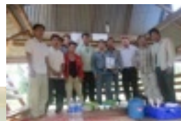
Crossfire Laos Pastors

doing greater things. He will use fear to try to silence us, distract us, and try to keep us from preaching the word of God in power. Every one of us deal with fear. Although each of us deal with different types of fear, the devil will try to intimidate us and hold us back with fear.