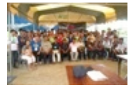
Crossfire Thailand Lahu Pastors presentation and local church set up

Crossfire Lahu tribal camp. This camp was in the mountains at a Korean camp ground, and there were approximately 700 youth who attended this camp from many different denominations. This camp was 3 days long, and we had more than 500 youth accept Christ during the 2 alter calls. During Wednesday afternoon, we presented Crossfire to these pastors, trained leaders, and set Crossfire up in many new churches.