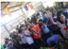
Salvation alter call Crossfire Philippines Mindanao summer camp