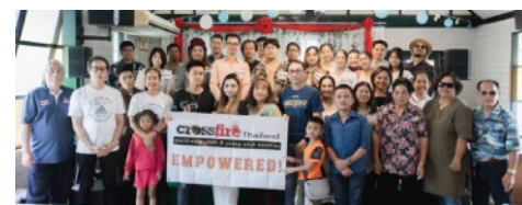
Crossfire Thailand leaders at a "Crossfire Music" worship event in Raying, June 2024