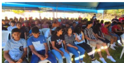
A Crossfire El Salvador evangelistic crusade in Cojutepeque March 2024

This month the Crossfire Philippines camp and leadership training will take place in Mindanao Island and teams will come to Mindanao from Camiguin, Bohol, and Visayas Islands to participate. Multiple Crossfire camps, crusades, pastors and leaders trainings/implementations will continue to take place all across Thailand this year and Crossfire mission teams will continue to travel from Thailand to Cambodia, Laos, and Myanmar to lead camps, evangelism, and implementations in new churches. Crossfire Kenya, Uganda, and Tanzania camps, crusades, and leadership training will take place in