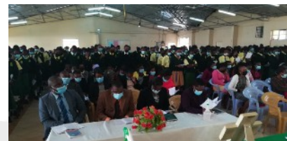
Crossfire Kenya crusade and leadership training in Nairobi March 2024

I have been blessed to have traveled to 81 countries in 6 continents and Crossfire International is now active in over 1000 churches in 35 nations around the world. Crossfire has been active in churches across Kenya, Uganda, and Tanzania for many years and I have been to Central and North Africa many times. However this will be the first time we have ever traveled to these 8 African nations and all of these countries will be new to Crossfire International. There is major interest