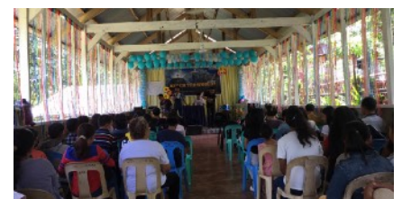
Crossfire Philippines camp in Cagayan de Oro City on Mindanao Island fall of 2023