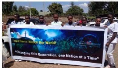
Youth at a Crossfire Kenya "Reach the World" camp and leadership training 2023

During our first three months of our time living in South Africa we will be traveling to a different African nation each week. In every one of these 8 African nations we will train pastors and leaders and implement the Crossfire structure in their churches. We will also train the