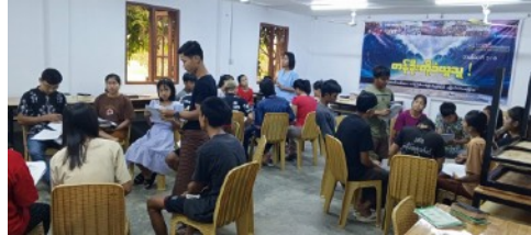
Crossfire Myanmar "Burma" Implementation and leadership training April 2024

ust we will lead the annual Crossfire El Salvador camp and leadership training in Oloquilta with teams of pastors and leaders coming to El Salvador from all across Central America. We will also lead multiple