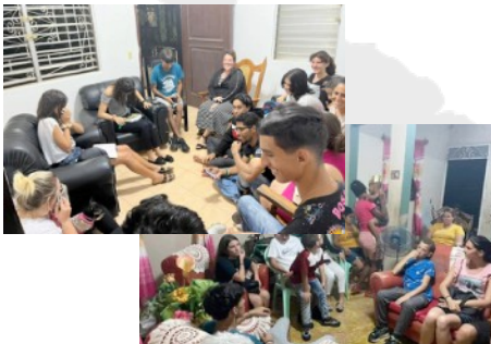
Some of the Crossfire Cuba cell groups in Matanzas Cuba June 2024

During our recent newsletters we shared many of the testimonies of what God did during the Crossfire International 6 month mission last year to Israel, Turkey, Cyprus, and Bulgaria. One of the unexpected testimonies during our time living in Israel was that God connected us with a pastor from Cuba who happened to be in Israel when we were there. Because I am fluent in Spanish and because we had all of the Crossfire materials in Spanish in Israel for the Spanish speaking messianic churches we were working with, we were able to train this Cuban pastor and